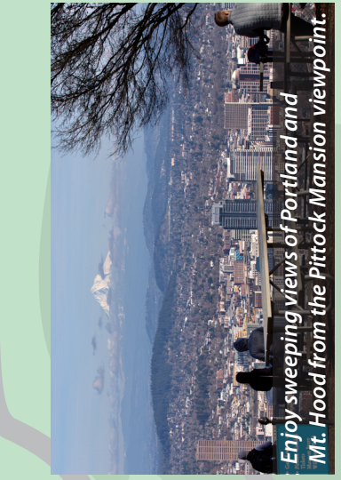
Enjoy sweeping views of Portland and Mt. Hood from the Pittock Mansion viewpoint.